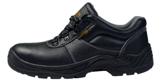
Barron Armour Safety Shoe (SF002)